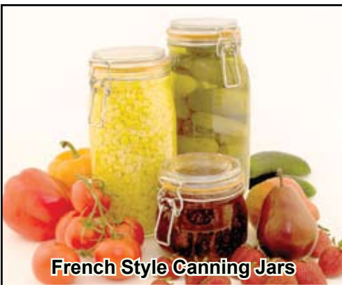
French Style Canning Jars