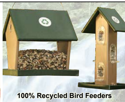
100% Recycled Bird Feeders