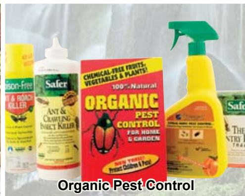
Organic Pest Control

Note: the cooperative board leadership development team of the CDS Consulting Co-op has recently revised its set of policy samples. It was a major revision and, in our view, transformational. We encourage you to give them consideration. ( www.cdsconsulting.coop/cbld )