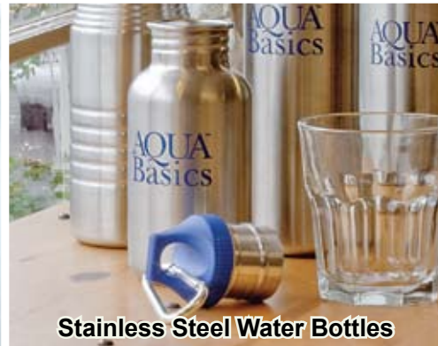
Stainless Steel Water Bottles