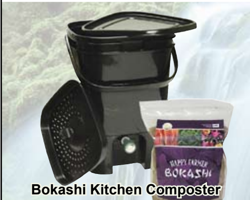
Bokashi Kitchen Composter