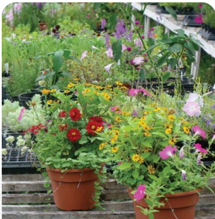
Plants at the Bloomingfoods East Garden Center all come from within 100 miles of the co-op, including natives, vegetable starts, herbs, and perennials from Stranger's Hill Organics in Bloomington.

timeline, and its costs. Making this information available is more helpful than getting caught in a quagmire of argument about the value of organics.