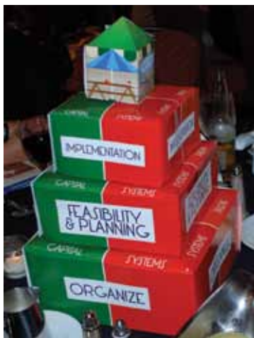
Above: A centerpiece on each table reminded attendees what it takes to start a food co-op.

The CCMA program and events were complemented by meetings among leading co-op organizations. A landmark half-day food co-op