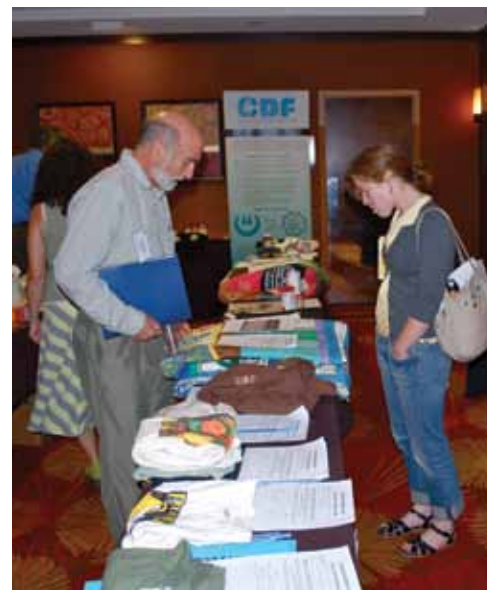
Silent auction items arrayed for the Bowers Fund. About $43,000 was raised for the Fund, exceeding the previous year's total.

T he 2013 Consumer Cooperative Management Association (CCMA) conference on June 6–8 brought 450 cooperators to Austin, Texas, for training and speakers, friendship and celebration. Many of the food co-op sector's new and veteran leaders were there to share accomplishments, honor special contributors, and wrestle with challenges and opportunities.