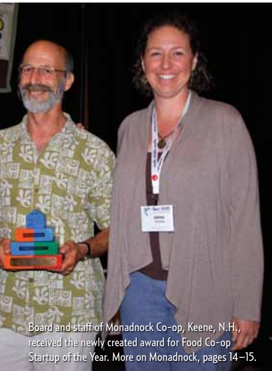
Board and staff of Monadnock Co-op, Keene, N.H., received the newly created award for Food Co-op Startup of the Year. More on Monadnock, pages 14–15.

cooperative boards of directors and continues to lead a dynamic, multistakeholder, multi-store cooperative that is an anchor in its local community.